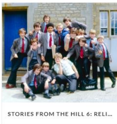
STORIES FROM THE HILL 6: RELI...