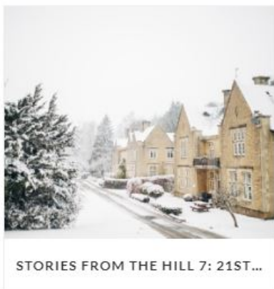
STORIES FROM THE HILL 7: 21ST...