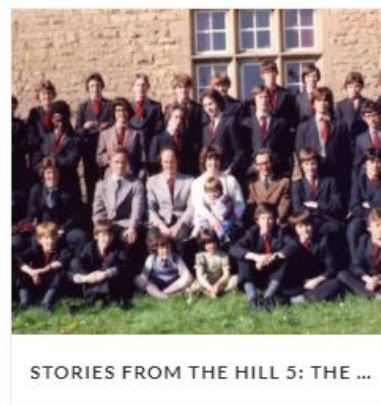
STORIES FROM THE HILL 5: THE ...